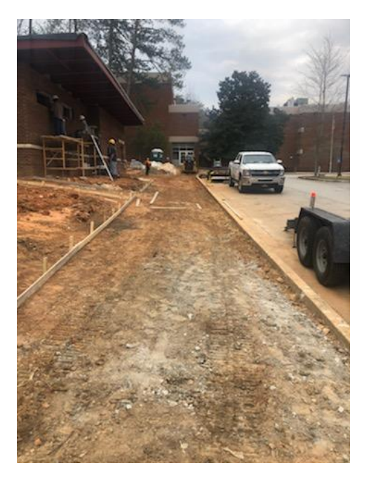
Figure 2 S. Atl – Grading for Sidewalks