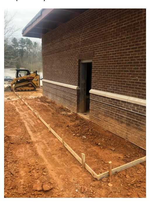
Figure 1 S. Atl –Grading for Sidewalks