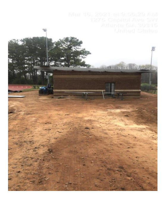
Figure 3 Carver – Roof Decking & Site Cleanup